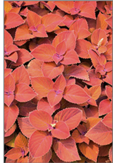
ColorBlaze Sedona Sunset Coleus foliage