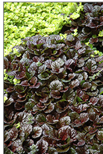
Black Scallop Bugleweed