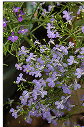
Laguna Sky Blue Lobelia flowers