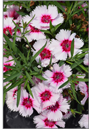
Super Parfait Raspberry Pinks flowers

Super Parfait Raspberry Pinks is a fine choice for the garden, but it is also a good selection for planting in outdoor pots and containers. It is often used as a 'filler' in the 'spiller-thriller-filler' container combination, providing a mass of flowers and foliage against which the thriller plants stand out. Note that when growing plants in outdoor containers and baskets, they may require more frequent waterings than they would in the yard or garden.