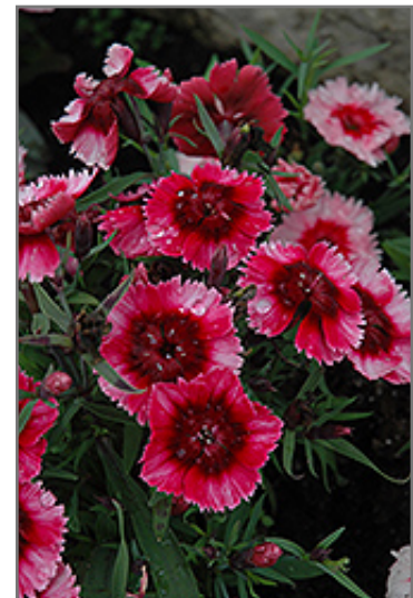
Super Parfait Raspberry Pinks flowers