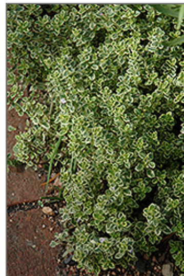
Aureus Lemon Thyme foliage