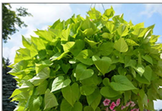
Sweet Caroline Sweetheart Lime Sweet Potato Vine