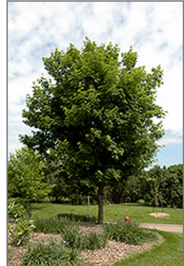
Sugar Maple

This tree should only be grown in full sunlight. It prefers to grow in average to moist conditions, and shouldn't be allowed to dry out. It is not particular as to soil pH, but grows best in rich soils. It is somewhat tolerant of urban pollution. This species is native to parts of North America.