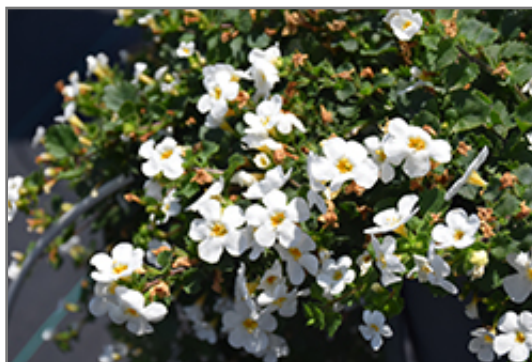
Snowstorm Snow Globe Bacopa flowers