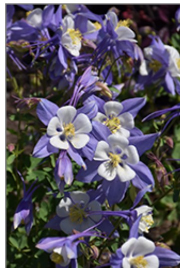
Songbird Blue Jay Columbine flowers

This is a relatively low maintenance plant, and should be cut back in late fall in preparation for winter. Deer don't particularly care for this plant and will usually leave it alone in favor of tastier treats. Gardeners should be aware of the following characteristic(s) that may warrant special consideration;