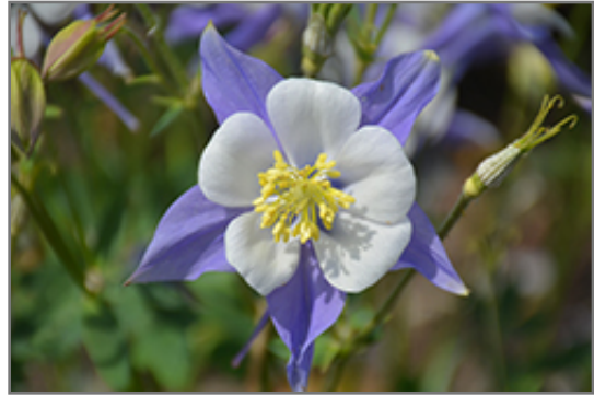
Songbird Blue Jay Columbine flowers