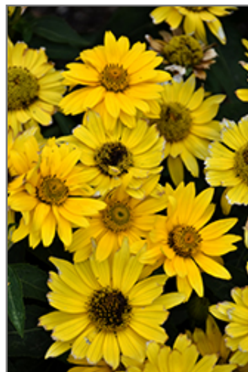
Tuscan Gold False Sunflower flowers

Tuscan Gold False Sunflower is recommended for the following landscape applications;