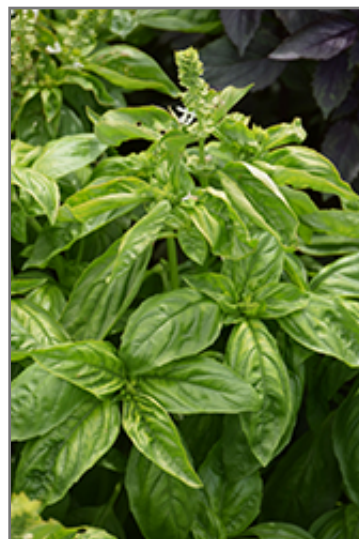
Genovese Basil foliage

Genovese Basil will grow to be about 20 inches tall at maturity, with a spread of 14 inches. When grown in masses or used as a bedding plant, individual plants should be spaced approximately 12 inches apart. This fast-growing annual will normally live for one full growing season, needing replacement the following year.