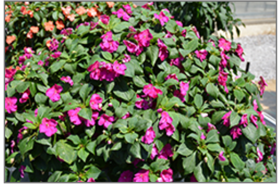
Beacon Violet Shades Impatiens in bloom

Beacon Violet Shades Impatiens will grow to be about 15 inches tall at maturity, with a spread of 12 inches. When grown in masses or used as a bedding plant, individual plants should be spaced approximately 8 inches apart. Its foliage tends to remain dense right to the ground, not requiring facer plants in front. This fast-growing annual will normally live for one full growing season, needing replacement the following year.