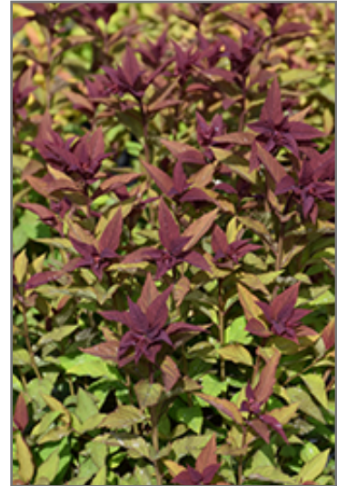
Double Play Doozie Spirea foliage

This shrub should only be grown in full sunlight. It prefers to grow in average to moist conditions, and shouldn't be allowed to dry out. It is not particular as to soil type or pH. It is highly tolerant of urban pollution and will even thrive in inner city environments. This particular variety is an interspecific hybrid.