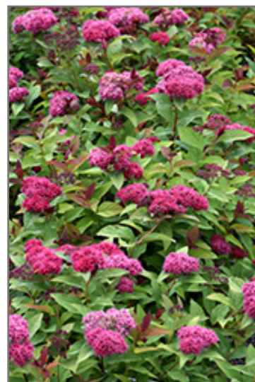
Double Play Doozie Spirea flowers