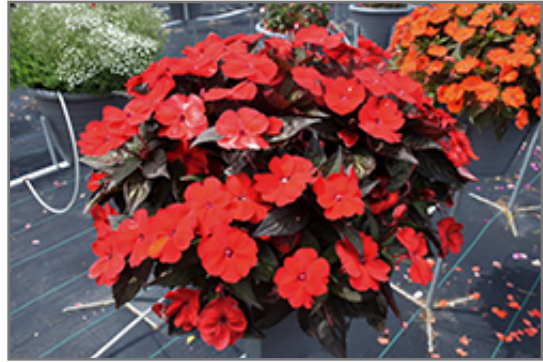
SunPatiens Compact Deep Red Impatiens in bloom

SunPatiens Compact Deep Red Impatiens is a fine choice for the garden, but it is also a good selection for planting in outdoor containers and hanging baskets. It can be used either as 'filler' or as a 'thriller' in the 'spiller-thriller-filler' container combination, depending on the height and form of the other plants used in the container planting. It is even sizeable enough that it can be grown alone in a suitable container. Note that when growing plants in outdoor containers and baskets, they may require more frequent waterings than they would in the yard or garden.