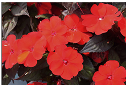
SunPatiens Compact Deep Red Impatiens flowers