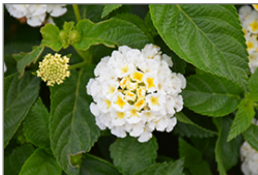
Havana Full Moon Lantana flowers

This is a relatively low maintenance plant, and should not require much pruning, except when necessary, such as to remove dieback. It is a good choice for attracting butterflies and hummingbirds to your yard, but is not particularly attractive to deer who tend to leave it alone in favor of tastier treats. It has no significant negative characteristics.