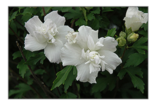
Jeanne D'Arc Rose Of Sharon flowers

Jeanne D'Arc Rose Of Sharon is recommended for the following landscape applications;