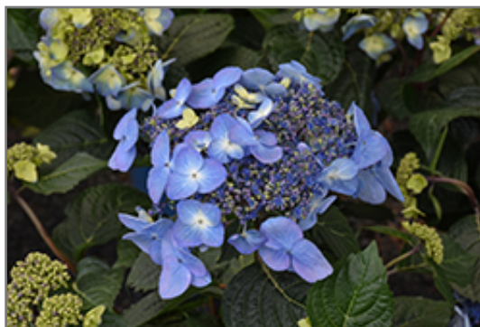
Endless Summer Pop Star Hydrangea flowers