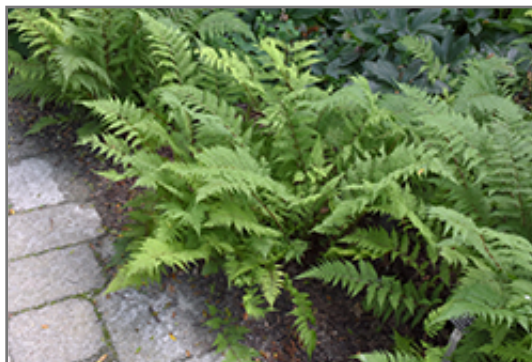
Lady in Red Fern