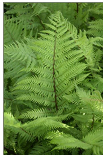
Lady in Red Fern foliage

Lady in Red Fern is recommended for the following landscape applications;