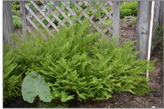
Lady in Red Fern

Lady in Red Fern will grow to be about 3 feet tall at maturity, with a spread of 24 inches. Its foliage tends to remain dense right to the ground, not requiring facer plants in front. It grows at a slow rate, and under ideal conditions can be expected to live for approximately 15 years. As an herbaceous perennial, this plant will usually die back to the crown each winter, and will regrow from the base each spring. Be careful not to disturb the crown in late winter when it may not be readily seen!