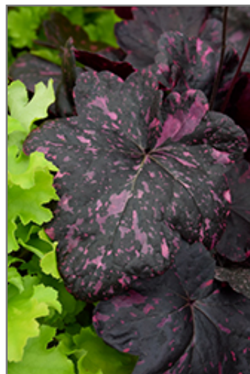
Midnight Rose Coral Bells foliage

Midnight Rose Coral Bells is recommended for the following landscape applications;