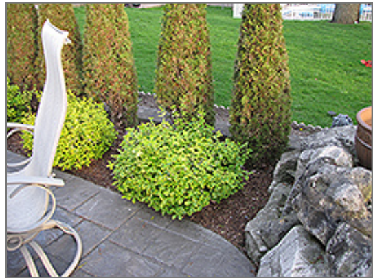
Country Gold Wintercreeper