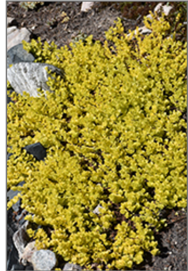
Goldilocks Creeping Jenny

Goldilocks Creeping Jenny will grow to be only 6 inches tall at maturity, with a spread of 3 feet. When grown in masses or used as a bedding plant, individual plants should be spaced approximately 24 inches apart. Its foliage tends to remain low and dense right to the ground. It grows at a fast rate, and under ideal conditions can be expected to live for approximately 10 years. As an herbaceous perennial, this plant will usually die back to the crown each winter, and will regrow from the base each spring. Be careful not to disturb the crown in late winter when it may not be readily seen!