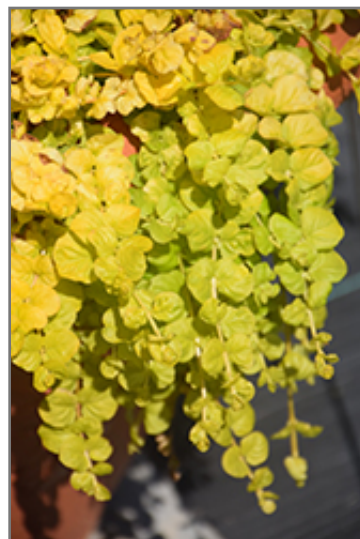
Goldilocks Creeping Jenny foliage