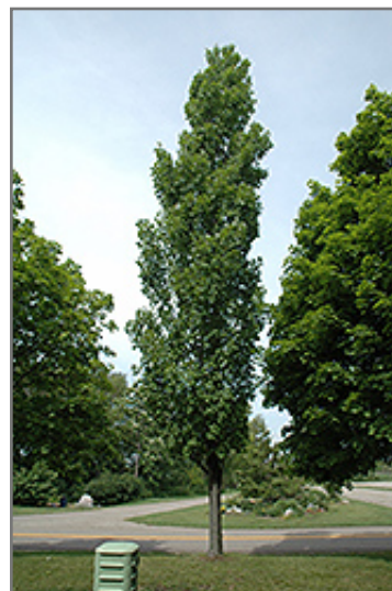
Armstrong Maple