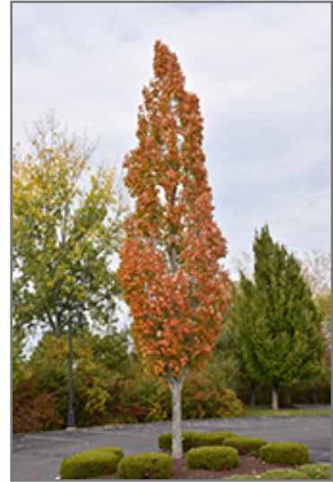
Armstrong Maple in fall

This tree should only be grown in full sunlight. It is quite adaptable, preferring to grow in average to wet conditions, and will even tolerate some standing water. It is not particular as to soil type or pH. It is highly tolerant of urban pollution and will even thrive in inner city environments. This particular variety is an interspecific hybrid.