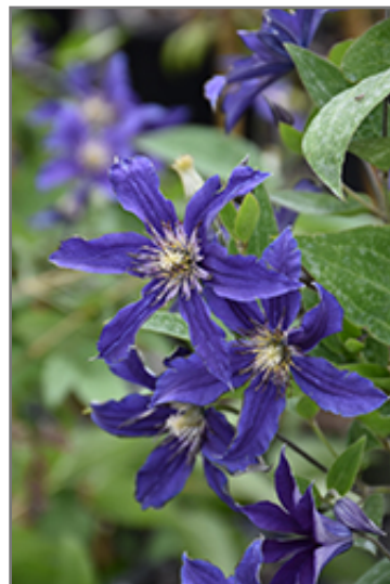
Sapphire Indigo Clematis flowers