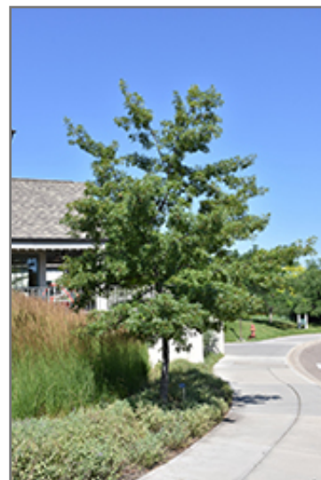
Majestic Skies Northern Pin Oak