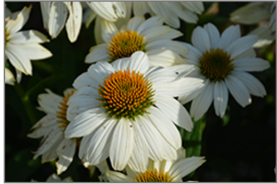
PowWow White Coneflower flowers

This is a relatively low maintenance plant, and is best cleaned up in early spring before it resumes active growth for the season. It is a good choice for attracting birds and butterflies to your yard, but is not particularly attractive to deer who tend to leave it alone in favor of tastier treats. It has no significant negative characteristics.