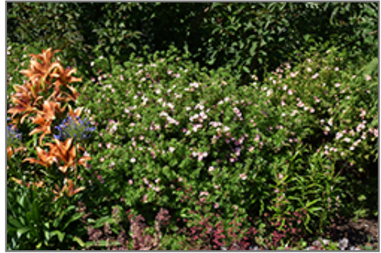
Pink Beauty Potentilla in bloom

This shrub does best in full sun to partial shade. It is very adaptable to both dry and moist locations, and should do just fine under typical garden conditions. It is considered to be drought-tolerant, and thus makes an ideal choice for a low-water garden or xeriscape application. It is not particular as to soil type or pH. It is highly tolerant of urban pollution and will even thrive in inner city environments. This is a selection of a native North American species.