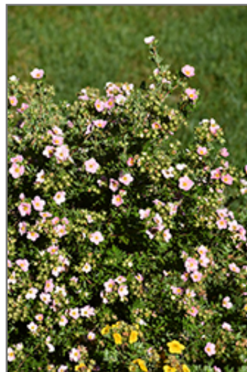
Pink Beauty Potentilla flowers