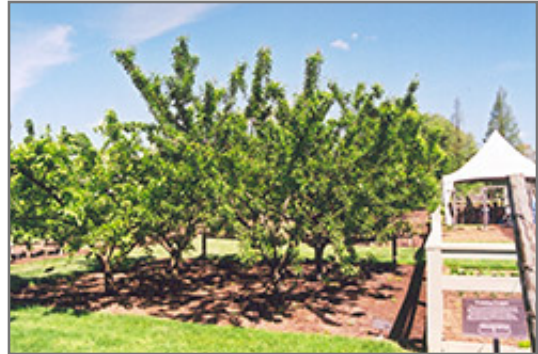
Mount Royal Plum

This tree is typically grown in a designated area of the yard because of its mature size and spread. It should only be grown in full sunlight. It does best in average to evenly moist conditions, but will not tolerate standing water. It is not particular as to soil type or pH. It is highly tolerant of urban pollution and will even thrive in inner city environments. This particular variety is an interspecific hybrid.