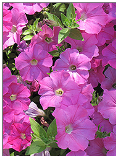
Easy Wave Pink Petunia flowers

This plant will require occasional maintenance and upkeep. Trim off the flower heads after they fade and die to encourage more blooms late into the season. It is a good choice for attracting hummingbirds to your yard, but is not particularly attractive to deer who tend to leave it alone in favor of tastier treats. It has no significant negative characteristics.