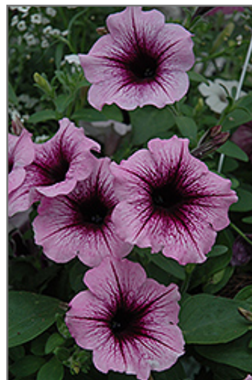
Supertunia Bordeaux Petunia flowers