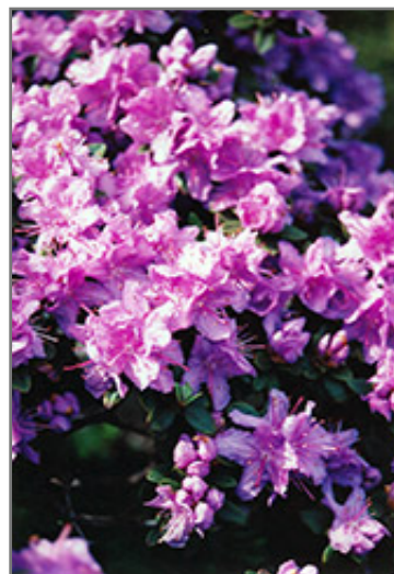
Ramapo Rhododendron flowers