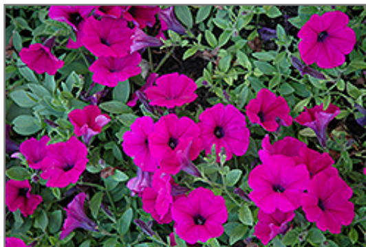
Wave Purple Classic Petunia flowers