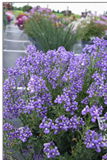
Bluebird Nemesia flowers