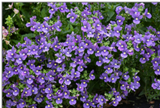
Bluebird Nemesia flowers