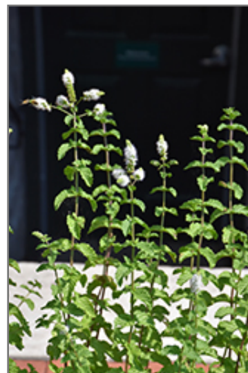
Spearmint flowers

Spearmint features bold spikes of lilac purple tubular flowers with white overtones rising above the foliage in late summer. Its attractive fragrant oval leaves remain green in colour throughout the season.