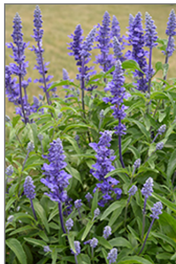
Victoria Blue Salvia flowers

Victoria Blue Salvia is recommended for the following landscape applications;