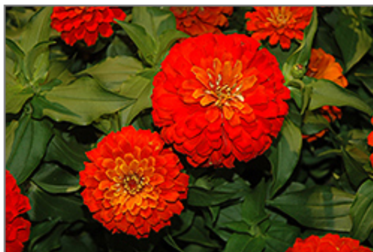
Dreamland Scarlet Zinnia flowers