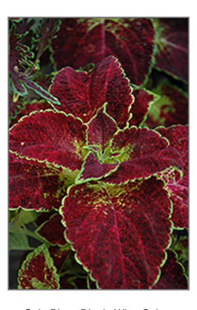
ColorBlaze Dipt in Wine Coleus foliage