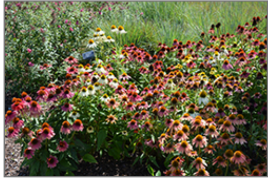
Cheyenne Spirit Coneflower in bloom

Cheyenne Spirit Coneflower will grow to be about 16 inches tall at maturity extending to 24 inches tall with the flowers, with a spread of 18 inches. Its foliage tends to remain dense right to the ground, not requiring facer plants in front. It grows at a medium rate, and under ideal conditions can be expected to live for approximately 10 years. As an herbaceous perennial, this plant will usually die back to the crown each winter, and will regrow from the base each spring. Be careful not to disturb the crown in late winter when it may not be readily seen!