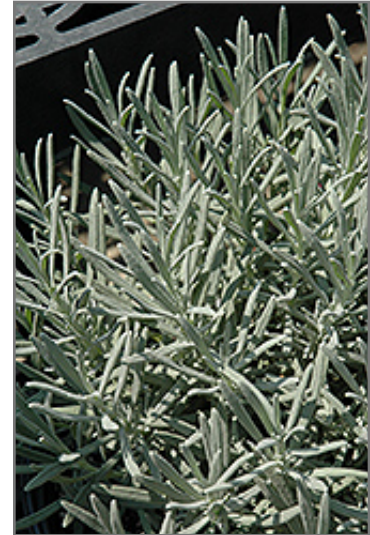
Phenomenal Lavender foliage

Phenomenal Lavender makes a fine choice for the outdoor landscape, but it is also well-suited for use in outdoor pots and containers. Because of its height, it is often used as a 'thriller' in the 'spiller-thriller-filler' container combination; plant it near the center of the pot, surrounded by smaller plants and those that spill over the edges. It is even sizeable enough that it can be grown alone in a suitable container. Note that when grown in a container, it may not perform exactly as indicated on the tag - this is to be expected. Also note that when growing plants in outdoor containers and baskets, they may require more frequent waterings than they would in the yard or garden.