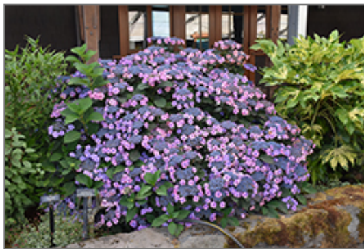
Tuff Stuff Hydrangea in bloom