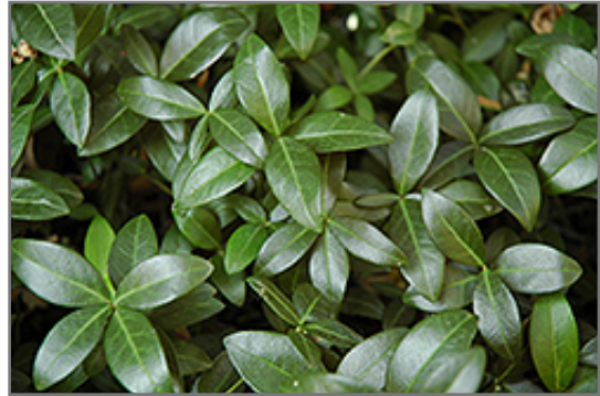
Bowles Periwinkle foliage

Bowles Periwinkle will grow to be only 4 inches tall at maturity extending to 6 inches tall with the flowers, with a spread of 18 inches. Its foliage tends to remain low and dense right to the ground. It grows at a fast rate, and under ideal conditions can be expected to live for approximately 10 years. As an evergreen perennial, this plant will typically keep its form and foliage year-round.