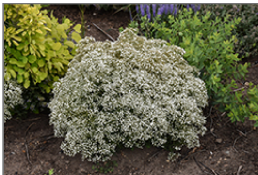
Summer Sparkles Baby's Breath in bloom