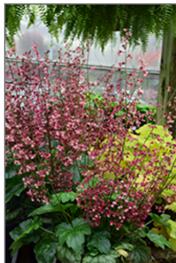
Berry Timeless Coral Bells in bloom

Berry Timeless Coral Bells is recommended for the following landscape applications;