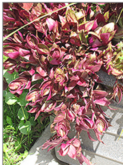
Purple Wandering Jew

Purple Wandering Jew is recommended for the following landscape applications;