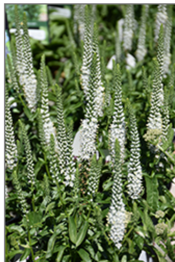
White Wands Speedwell flowers

White Wands Speedwell is recommended for the following landscape applications;