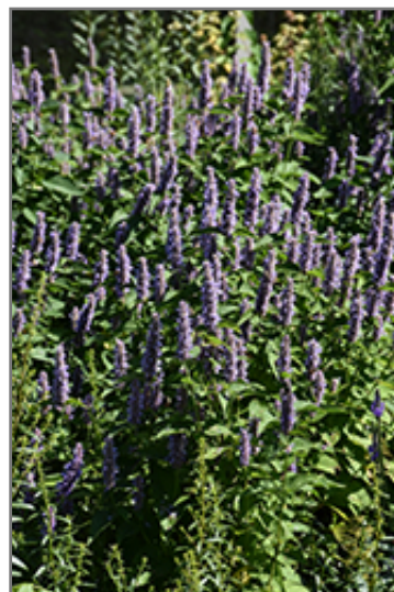
Anise Hyssop flowers

Anise Hyssop is recommended for the following landscape applications;