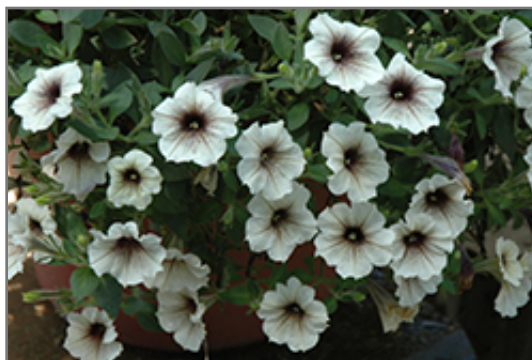
Supertunia Latte Petunia flowers