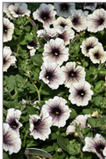
Supertunia Latte Petunia flowers