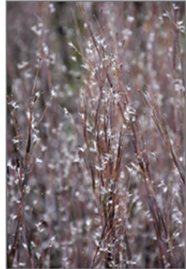
Standing Ovation Bluestem fruit

This plant should only be grown in full sunlight. It is very adaptable to both dry and moist locations, and should do just fine under typical garden conditions. It is considered to be drought-tolerant, and thus makes an ideal choice for a low-water garden or xeriscape application. It is not particular as to soil type or pH. It is somewhat tolerant of urban pollution. This is a selection of a native North American species. It can be propagated by division; however, as a cultivated variety, be aware that it may be subject to certain restrictions or prohibitions on propagation.