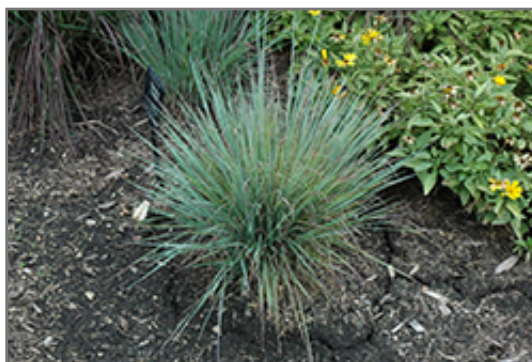
Standing Ovation Bluestem