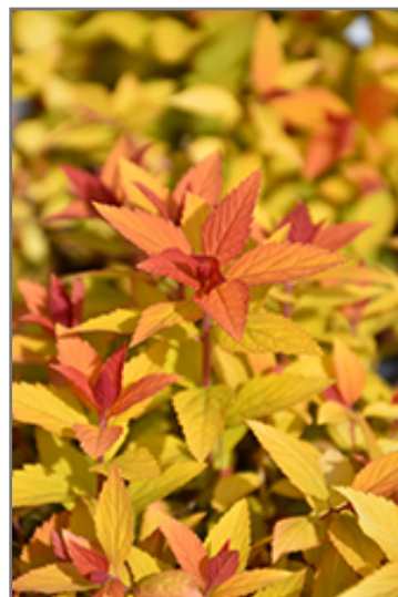
Double Play Candy Corn Spirea foliage

Double Play Candy Corn Spirea is recommended for the following landscape applications;