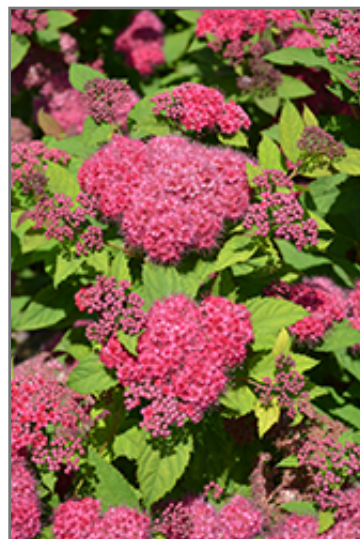
Double Play Red Spirea flowers

Double Play Red Spirea is recommended for the following landscape applications;