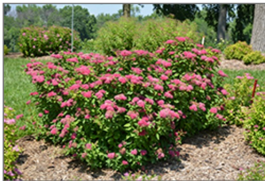
Double Play Red Spirea in bloom