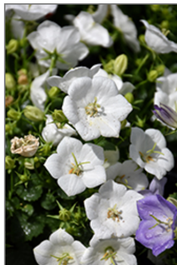
Rapido White Bellflower flowers